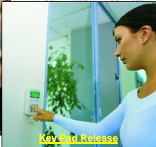
Key Pad Release