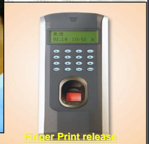
Finger Print release

At TSS you can trust that we will meet your needs as we specialise in all areas of security, with our personal touch one of our surveyors will attend your premises and advice which product will work best for you and your business needs.